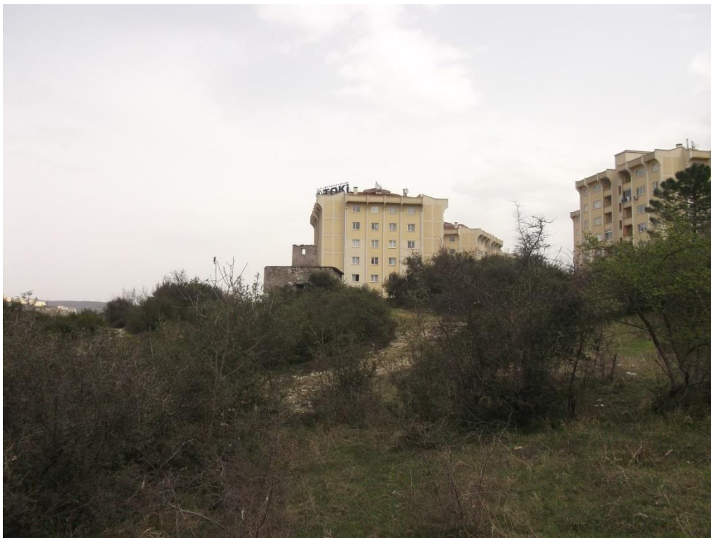
Photo 1 View from the Project Site (east border of the Site, TOKİ view)