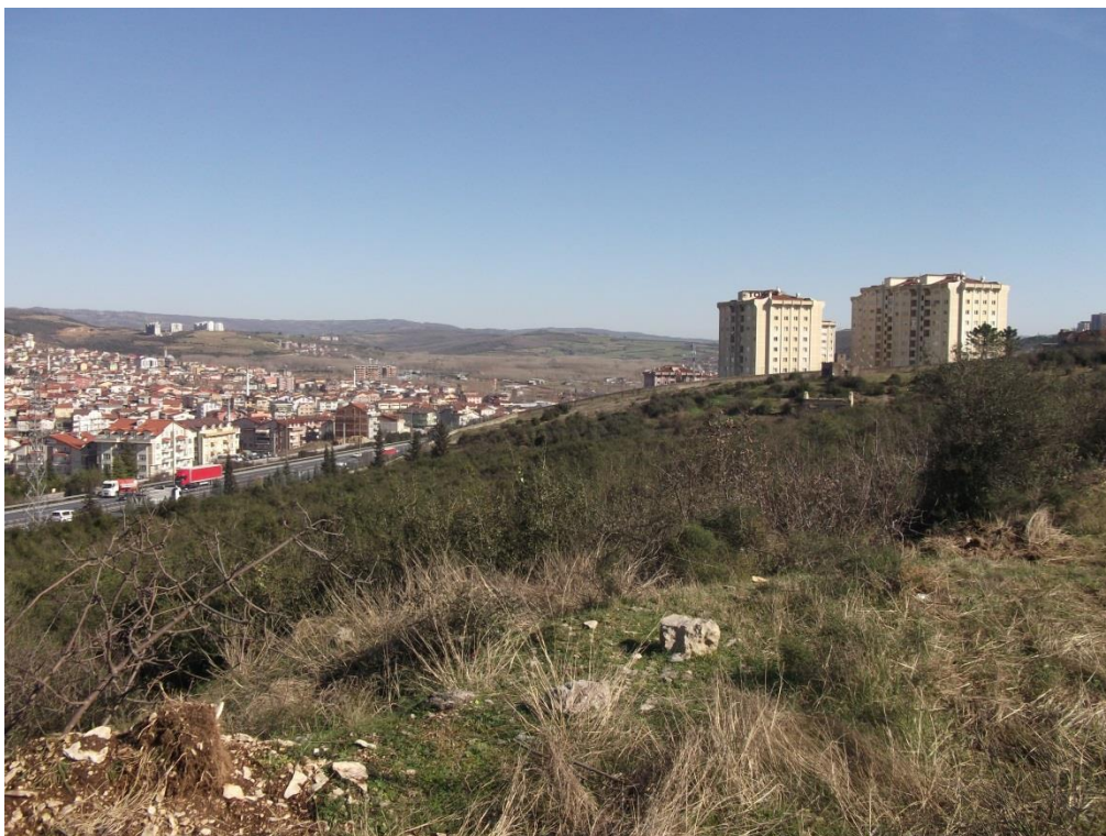
Photo 3 View from the Project Site (from centre of the Project Site to east direction, TOKİ view)