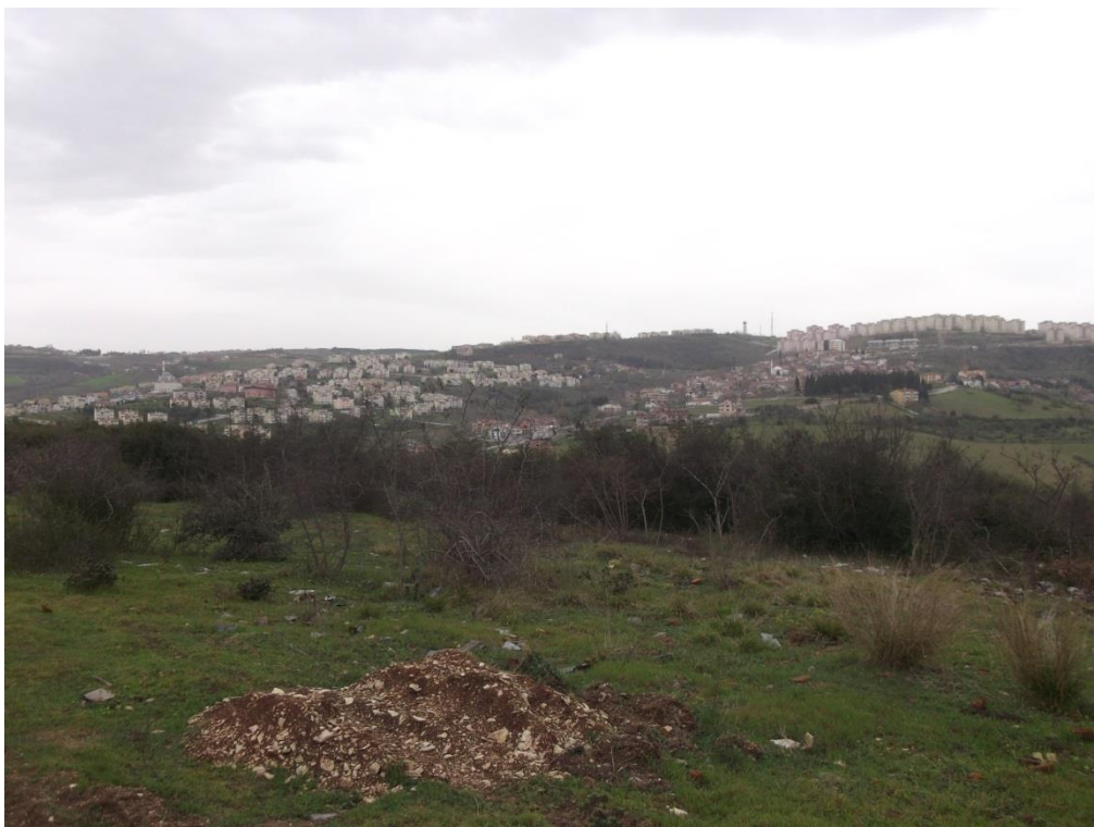
Photo 7 View from the Project Site (from south of the Project Site to north direction)