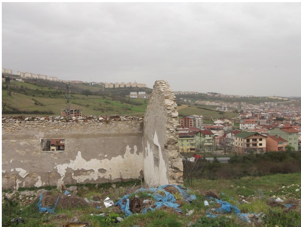
Photo 11 View from the Project Site (view of the partially demolished structure at the centre of the Project Site)