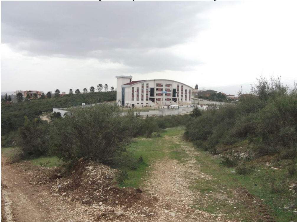
Photo 8 View from the Project Site (southeast border of the Project Site, Hacı Bektaş Veli School view)