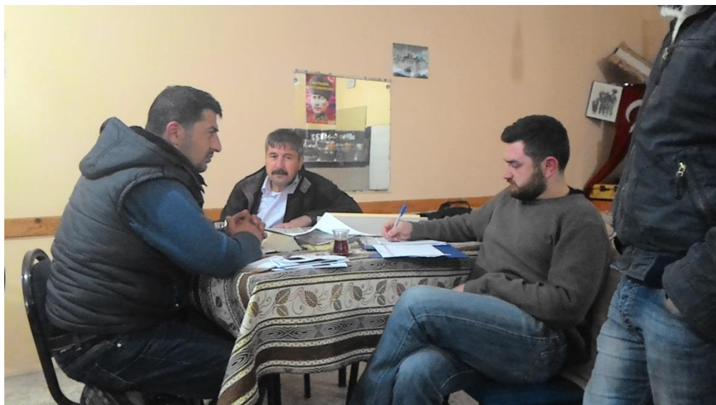
Photo 12 View from the social baseline survey