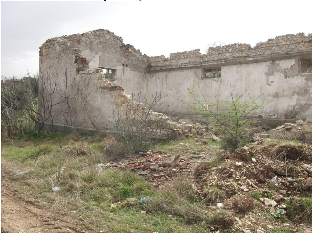
Photo 10 View from the Project Site (view of the partially demolished structure at the centre of the Project Site)