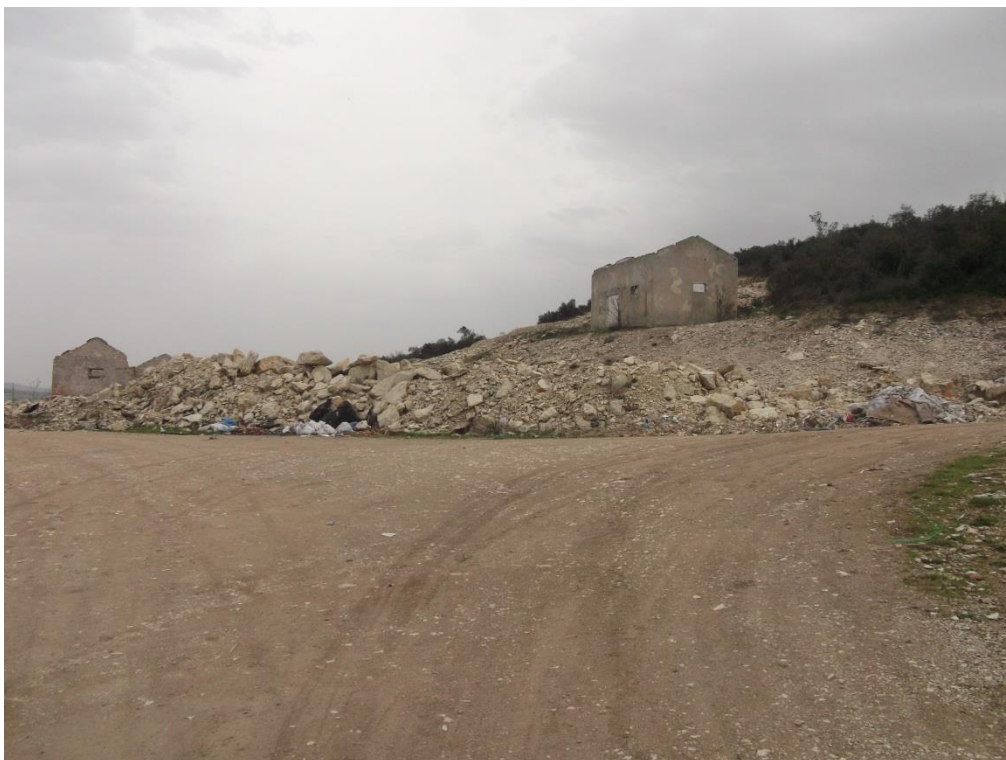
Photo 9 View from the Project Site (view of the demolished structure at the centre of the Project Site)