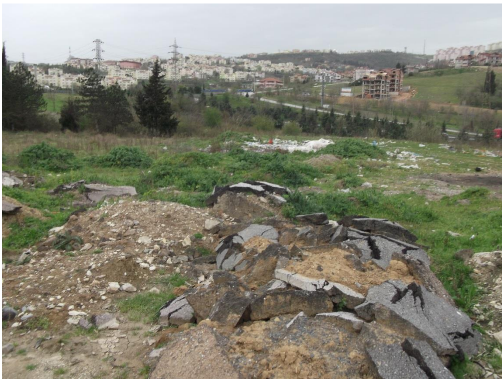
Photo 5 View from the Project Site (from centre of the Project Site to northeast direction, Malta neighborhood)