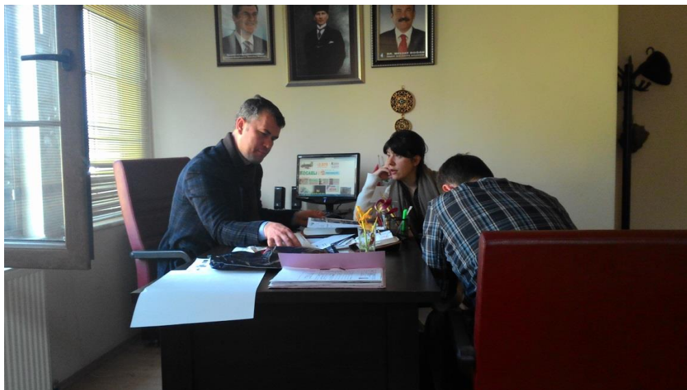
Photo 13 View from the social baseline survey - 2