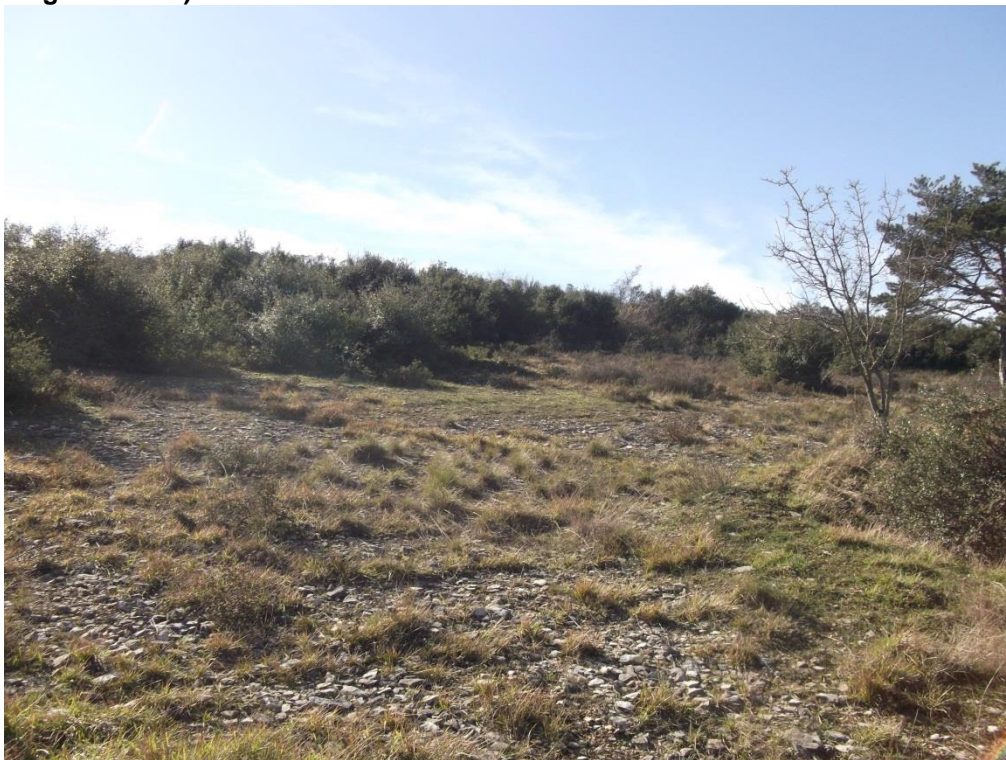
Photo 6 View from the Project Site (from centre of the Project Site to south direction)